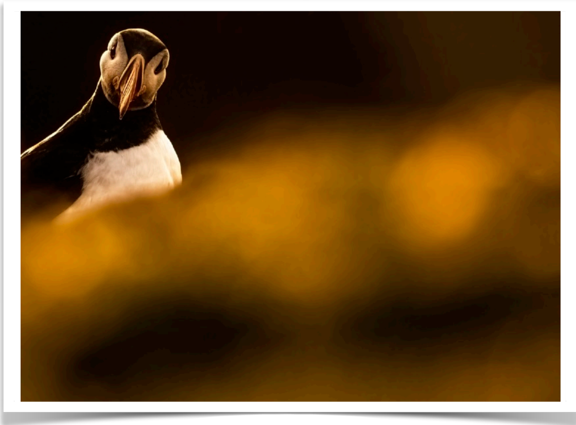
Puffin photographed in beautiful backlight on Grimsey Island by David during his recce trip in 2023

Total price of trip is £2,600. A deposit of £600 is payable upon booking, with the balance payable early May 2024.